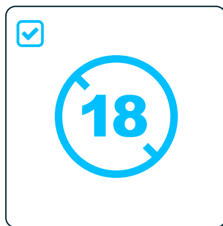
Over the age of 18