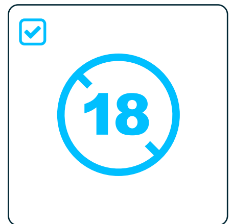
Over the age of 18