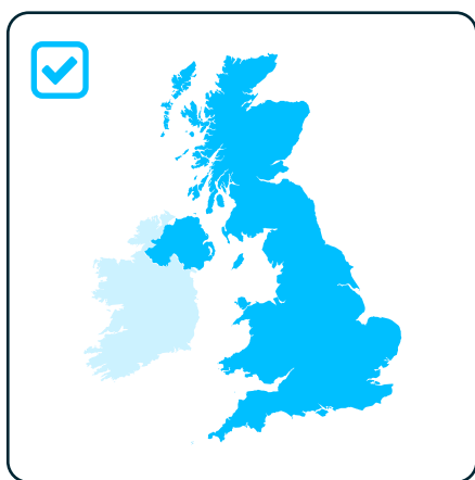
A Resident of the United Kingdom