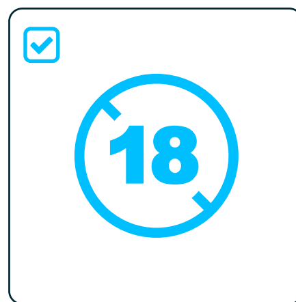
Over the age of 18