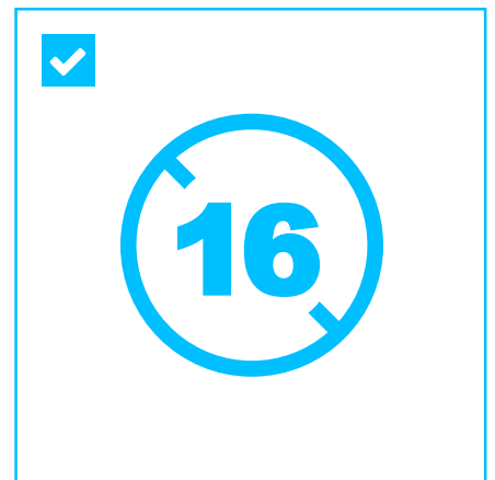
Over the age of 16